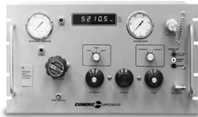
UPC5210 - 19 inch wide rack-mountable version of UPC5200