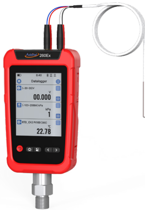
ADT260Ex with AM1602 temperature probe

Note: The ADT260Ex can be purchased without the ADT158Ex module if needed using the following part number: ADT260EX-NO