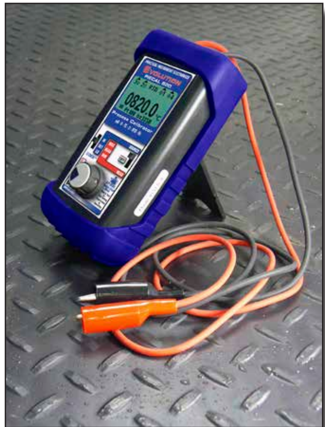
Flip out stand for bench use

* Thermocouple extension wire, stripped on one end with a corresponding miniature thermocouple male connector on the other end.