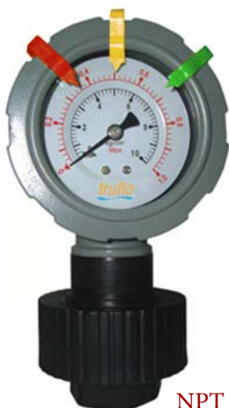
NPT Process Connection