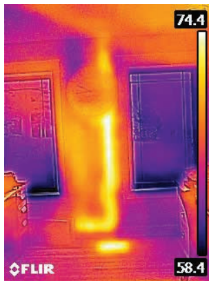
Warm Drain Pipe in Wall