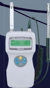
Instrument with Optional Air Velocity and Temperature/Humidity Probes