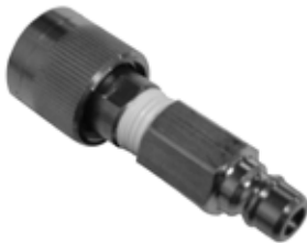
55294 -No Tools Required