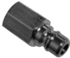
55394 or 130239