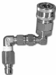
"107288 - NO TOOLS REQUIRED"