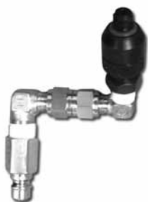
"106594 - NO TOOLS REQUIRED"

Note: Consult factory with your specific Test Port configuration requirements.