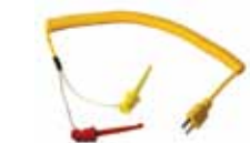
Thermocouple Type K

Thermocouple compensated Mini-Grabbers provide a continuous thermocouple connection from bare wires to the measuring instrument without attaching plugs. These connectors will save time and improve the accuracy of your measurement. Stop making thermocouple measurements with copper connections.