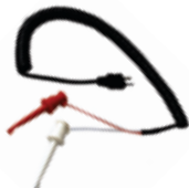
Thermocouple Type J