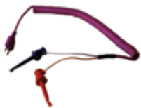
Thermocouple Type E