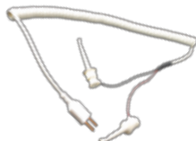
Uncompensated Cu/Cu Copper/Copper

EDL Mini-Grabbers are ordered by part #. The numbering system listed below is designed so you can easily identify the thermocouple type, lead type, lead length, and termination.