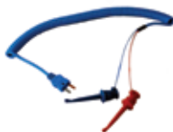
Thermocouple Type T