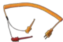
Thermocouple Type N