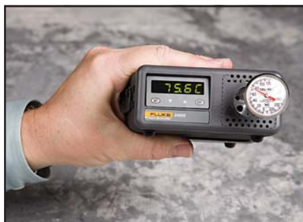
Take the 9100S anywhere. It's the smallest dry-well in the world.

Since we introduced the world's first truly handheld dry-well, many have tried to duplicate it. Despite its small size (57 mm [2¼ in] high and 127 mm [5 in] wide) and light weight, the 9100S outperforms every dry-well in its class in the world.