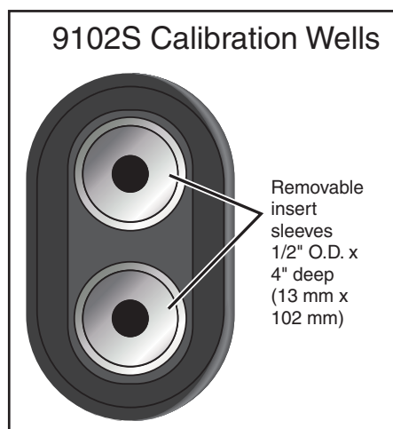
9102S block configuration. Instrument includes 1/4" and 3/16" inserts. Order additional sizes as needed.